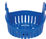
Strainer Base 1232R