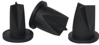
Check Valve Included